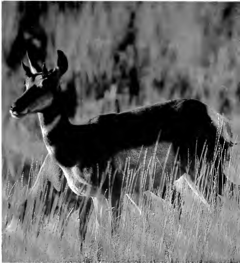
Antelope: Mike Logan

“ . . . Game has been the orphan child without asylum in the conservation world. No provision has been made for its permanent home. There has been no Government agency entrusted with its custodianship. It has subsisted on the crumbs dropped from the table of forestry, parks, reclamation and advancing civilization. That it has escaped total extinction is through no foresight or comprehensive plan . . . . ”—J.N. Darling